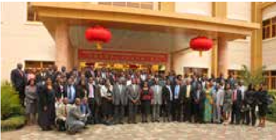
Senior OAG staff that attended the Planning Meeting for 2014 at Golden Peacock Hotel in Lusaka recently