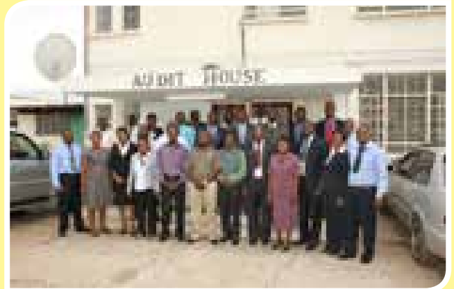
Ndola Audit Office staff