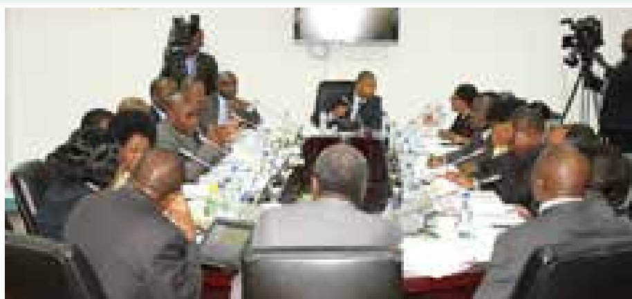
PAC in session

However, a scrutiny of supporting documents revealed that the officers