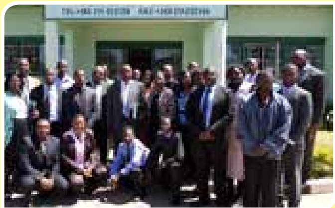
Lusaka province Audit Office staff