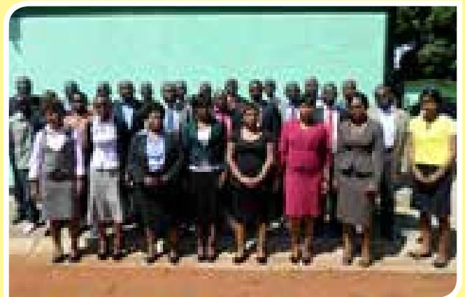
Livingstone Audit Office staff