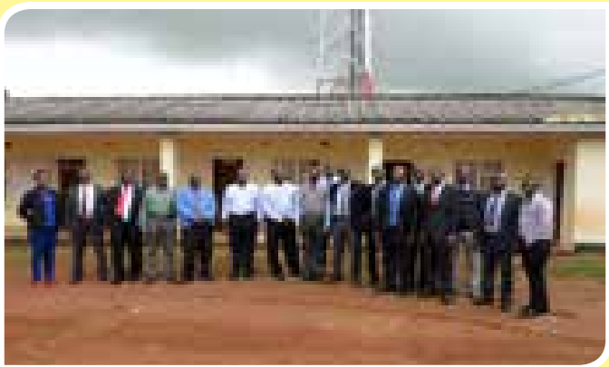
Chinsali Audit Office staff