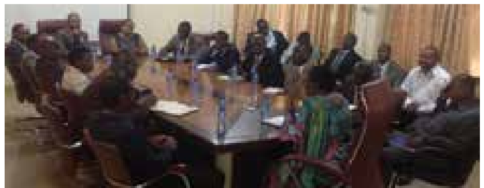
Zambian PAC delegation in a meeting in Ghana recently

The Committee interacted with the office of the Controller and Accountant General of Ghana. During the interaction, the Accountant General briefed the Committee on the operation of the office including the structure. On the involvement in extractive industry, the Committee was informed that the Office only facilitate the disbursements of the royalties and revenues received from the mines.