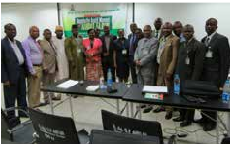
Audit Flow roll out participants during the training in Nigeria recently