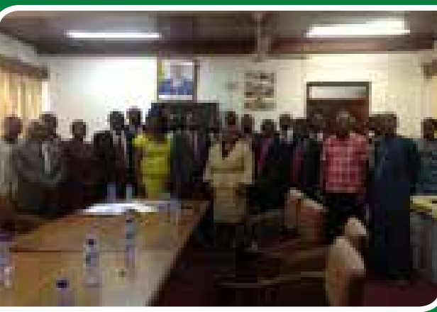
The Zambian PAC delegation pose for a photo after a meeting