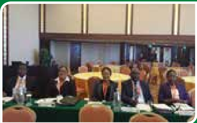
The Zambian delegation to the Commonwealth Auditors General conference in Malta