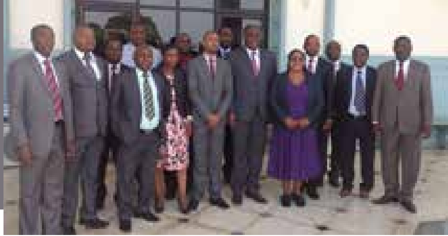
The Zambian PAC delegation pose for a photo after a meeting with Ghanaian officials

The delegation also witnessed the proceedings of the Public Accounts Committee where it was learned that the sittings are covered live on television using the Public Media at no cost as this is one of the Mandate of the Public Broadcaster to disseminate information.