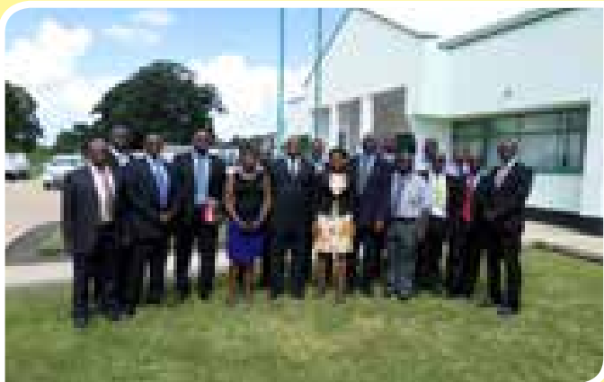
Mansa Audit Office staff