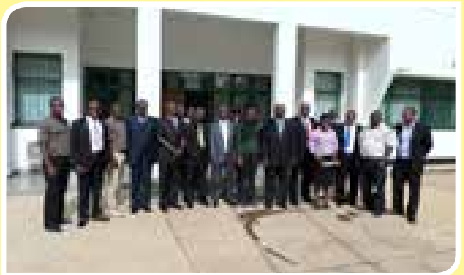
Kasama Audit Office staff