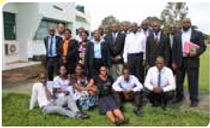
Solwezi Audit Office staff