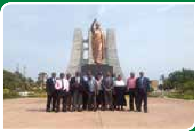
The Zambian PAC delegation that undertook the benchmarking tour to Ghana