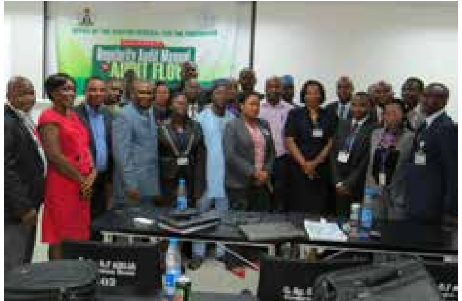
IT Audit Manager and regional Trainer participants in Nigeria

After the RAM training, the SAI was then